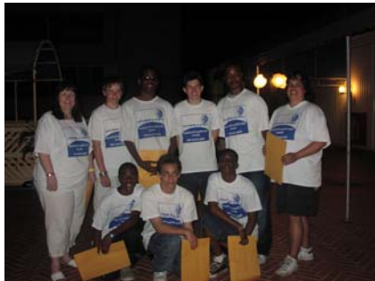
Urban Steel in our Hell's Gate shirts!!!!