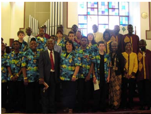
The photo shows us with members of Hell's Gate and some of the Anti-