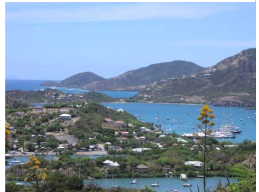
A view from the hilltop at the Royal Antiguan Hotel St. John's, Antigua.

the Marshall students dug in and learned their parts. The immediate connection through music was apparent to all especially when Urban Steel began playing "Africa". only to find Hell's Gate, and St. Joseph's performers jumping in to learn the parts. Music is truly the universal language.